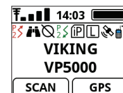
Day - High Contrast