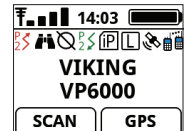
Day - High Contrast